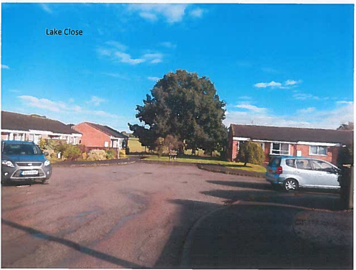
30<sup>th</sup> September 2016