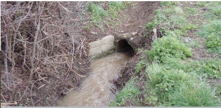
If you are unsure whether you are the riparian owner of the watercourse running through your land, check the title deeds of your property.

You must accept flood water through your land, even if any excess water is caused by inadequate capacity downstream. Landowners downstream of your property are under no obligation to improve the drainage capacity of their stretch of watercourse although they have the same responsibilities as you to maintain it.