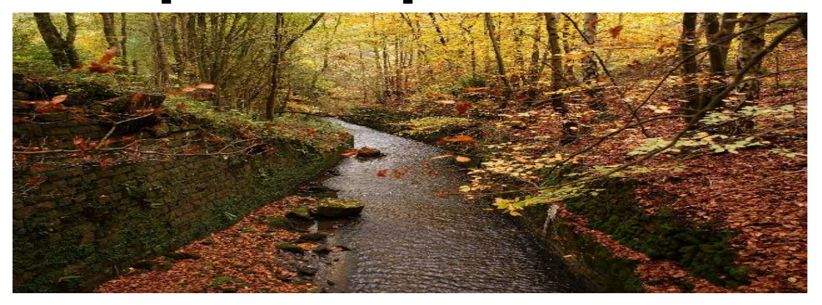
Cinderford Brook