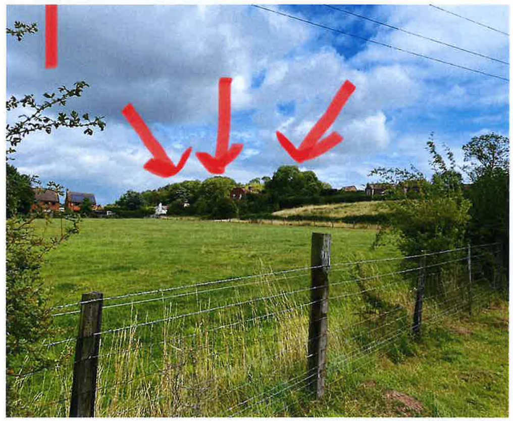
View from a public footpath to the south west