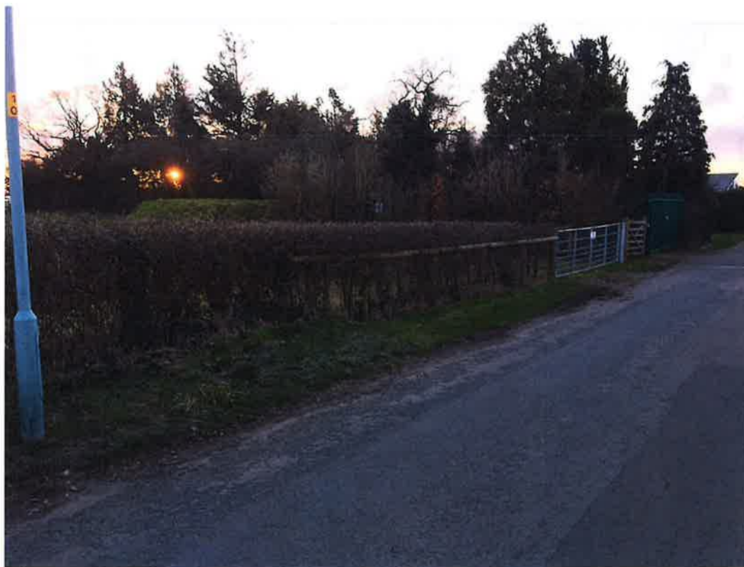
View from the north