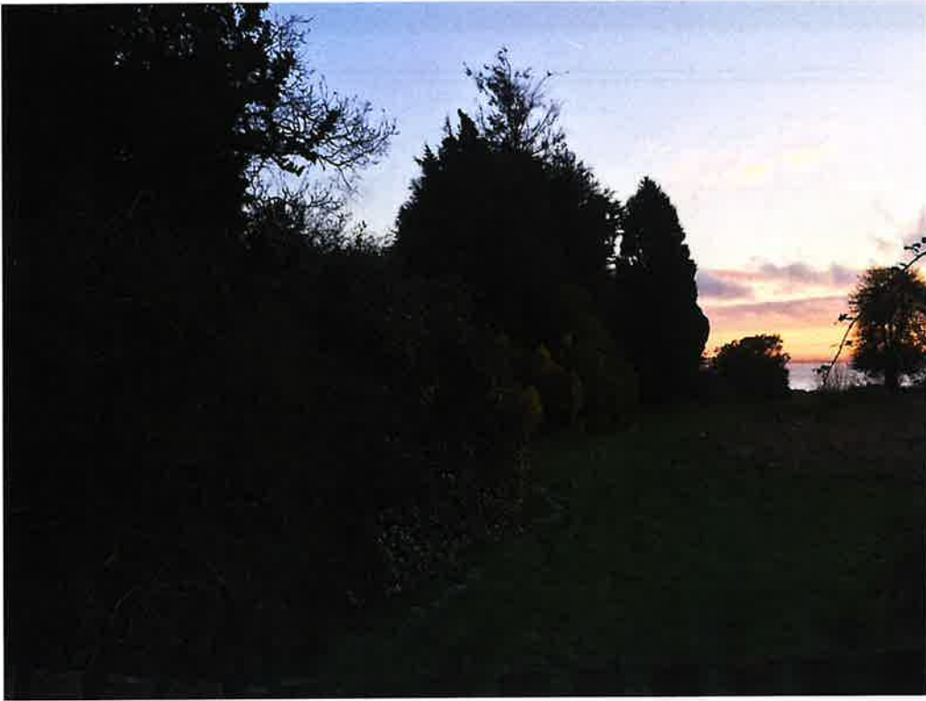
View into site