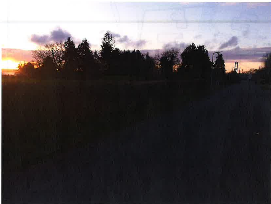
View from the North