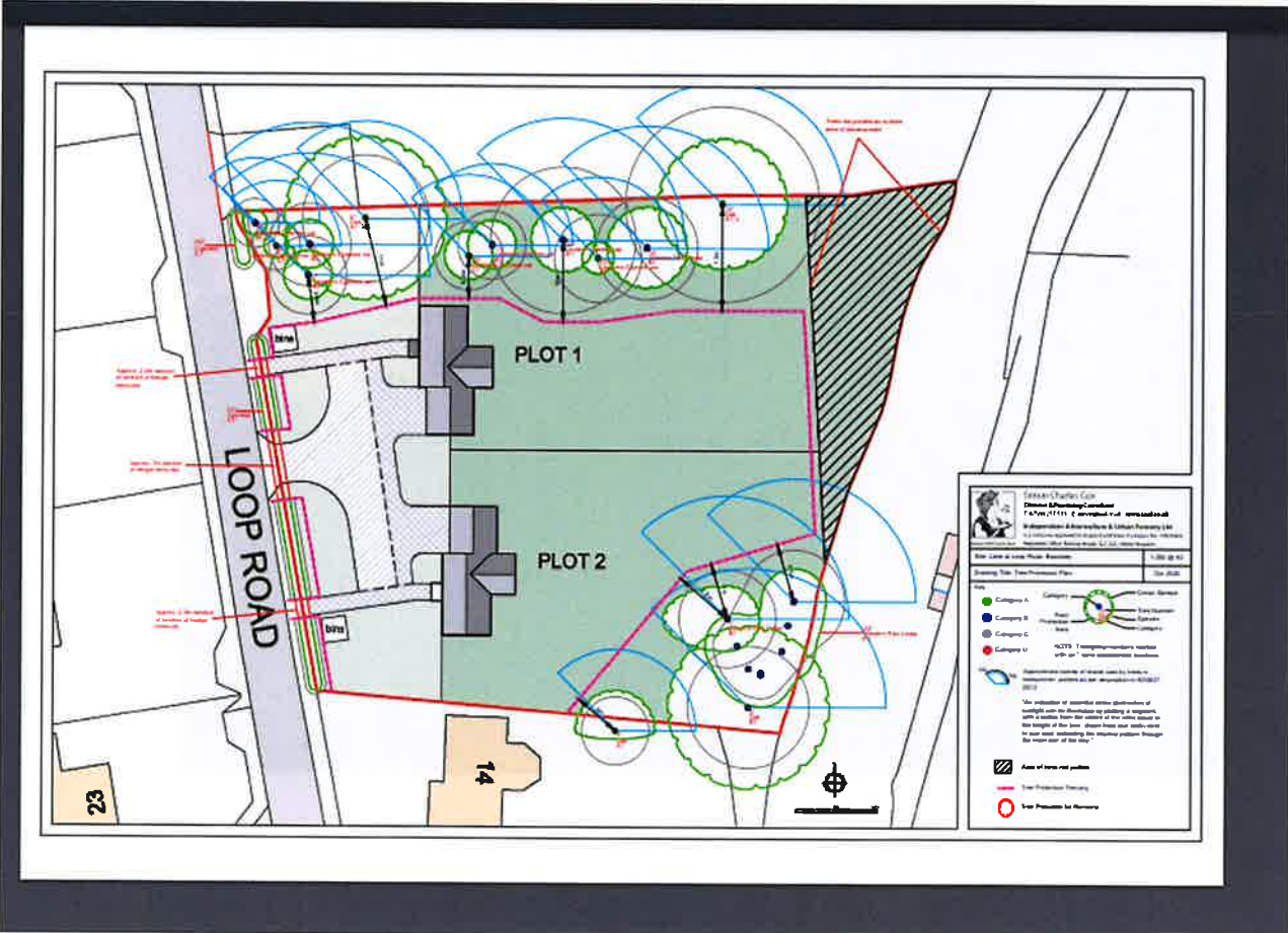
Submitted Tree Survey & Protection Plan