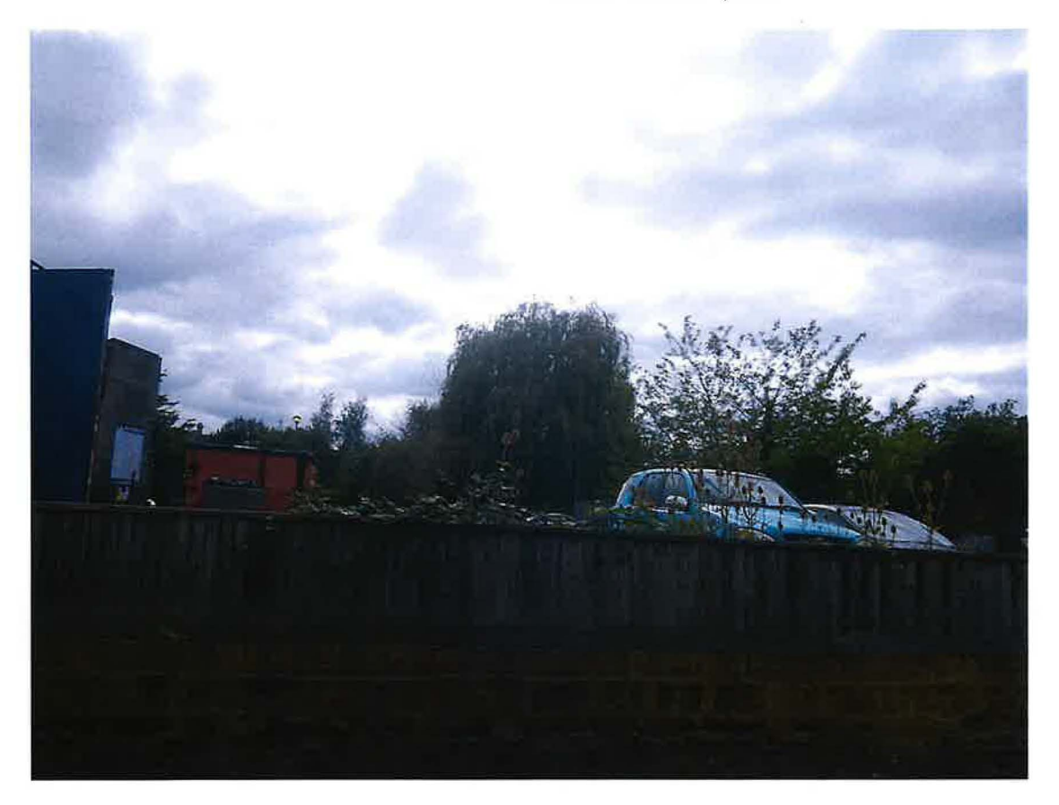
View from the north-east along on Bury Bar Lane