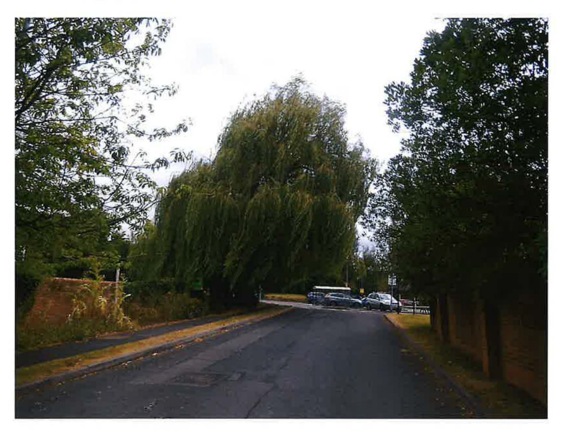
Looking south from approach to Co-Op car park.