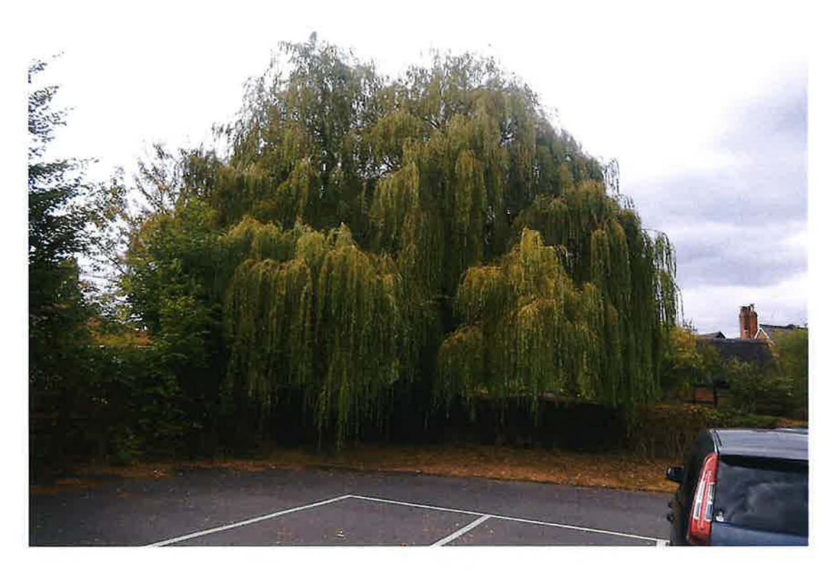
View from Newent Memorial Hall car park