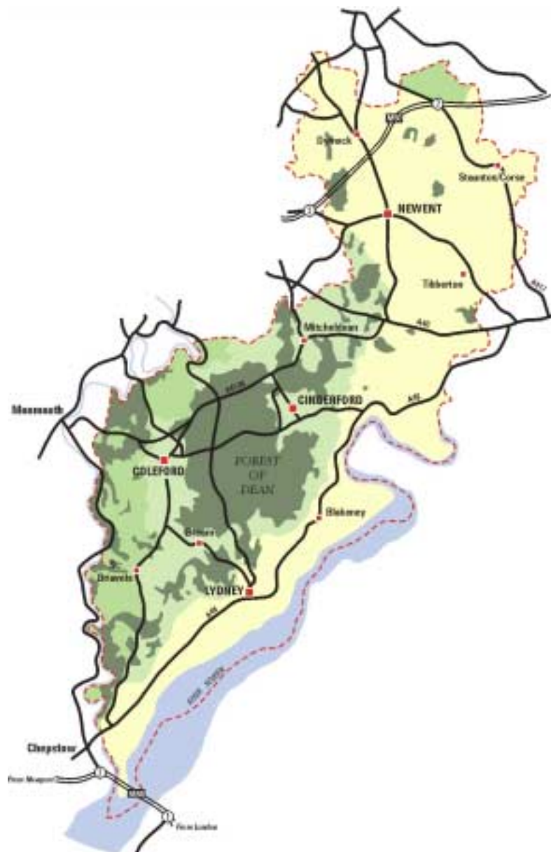
Figure 1: Map of the Forest of Dean District

The Forest of Dean District lies on the boundary between England and Wales. It occupies the western part of Gloucestershire, bounded by the Malvern Hills in the north, the River Wye to the west and the River Severn to the south and east.