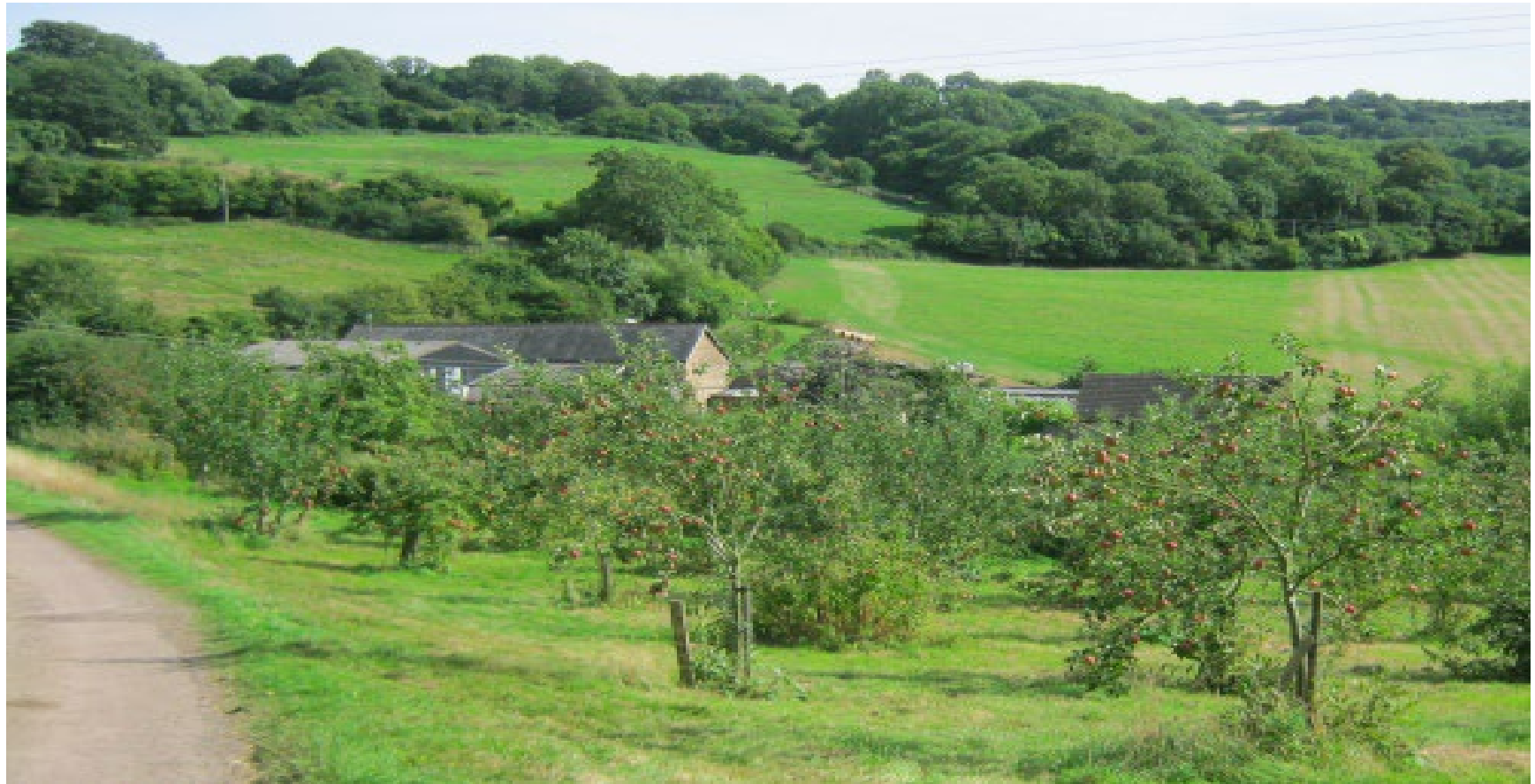
Ragman's Lane Farm, Ruardean

Reviving local livelihoods, reducing the ecological footprint of the communities in the region.